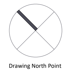
Drawing North Point