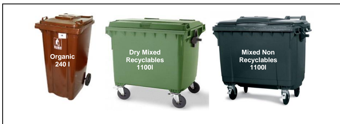
Figure 5.1 Typical waste receptacles of varying size (240L and 1100L)

The types of bins used will vary in size, design and colour dependent on the appointed waste contractor. However, examples of typical receptacles to be provided in the WSAs are shown in Figure 5.1. All waste receptacles used will comply with the SIST EN 840-1:2020 and SIST EN 840-2:2020 standards for performance requirements of mobile waste containers, where appropriate.